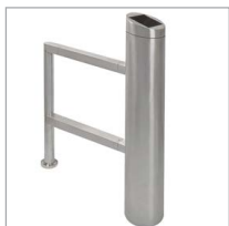
SWB_RL railing with built-in IR sensor