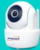
Indoor PTZ Camera