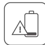
Low Battery Warning