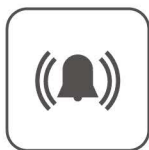
Door Bell Ring